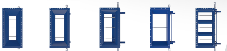
13 x 42

Door runners ensure rack and pinion stay fully engaged for reliable opening and closing